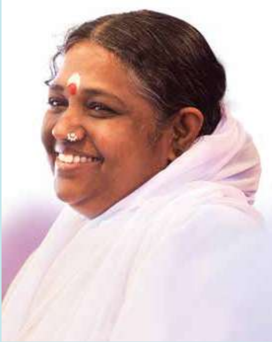
Sri Mata Amritanandamayi Devi

There are two types of Education Education for Living. Education for Life.